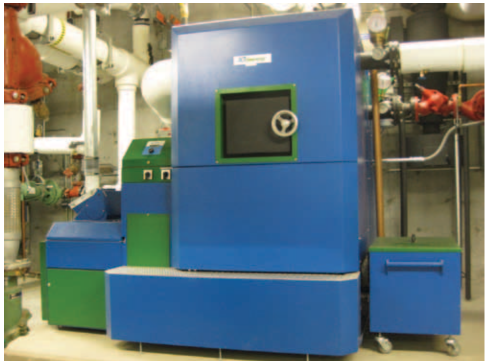
1.7 million Btu per hour boiler supplied by ACT Bioenergy.

When wood is harvested from sustainably managed forests, the net greenhouse gas emissions from biomass thermal are favorable. Although carbon dioxide emissions are released when wood is burned, it is equivalent to the carbon emissions that would be released if the wood was left to decay in the forest or released during a forest fire. When fossil fuels are burned, carbon dioxide is re-released from long-term geologic storage.