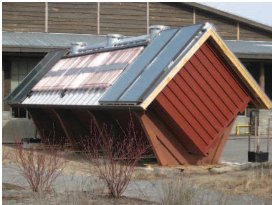
The Wild Center

Many small commercial-scale combustion systems have been optimized to burn wood pellets dry. Pellets are made from compressed sawdust. The advantages of the pellets include: minimal moisture content, resulting in an ability to burn hotter and cleaner than wet wood chips which helps increase efficiency and reduce emissions. The pellets also have a rela-