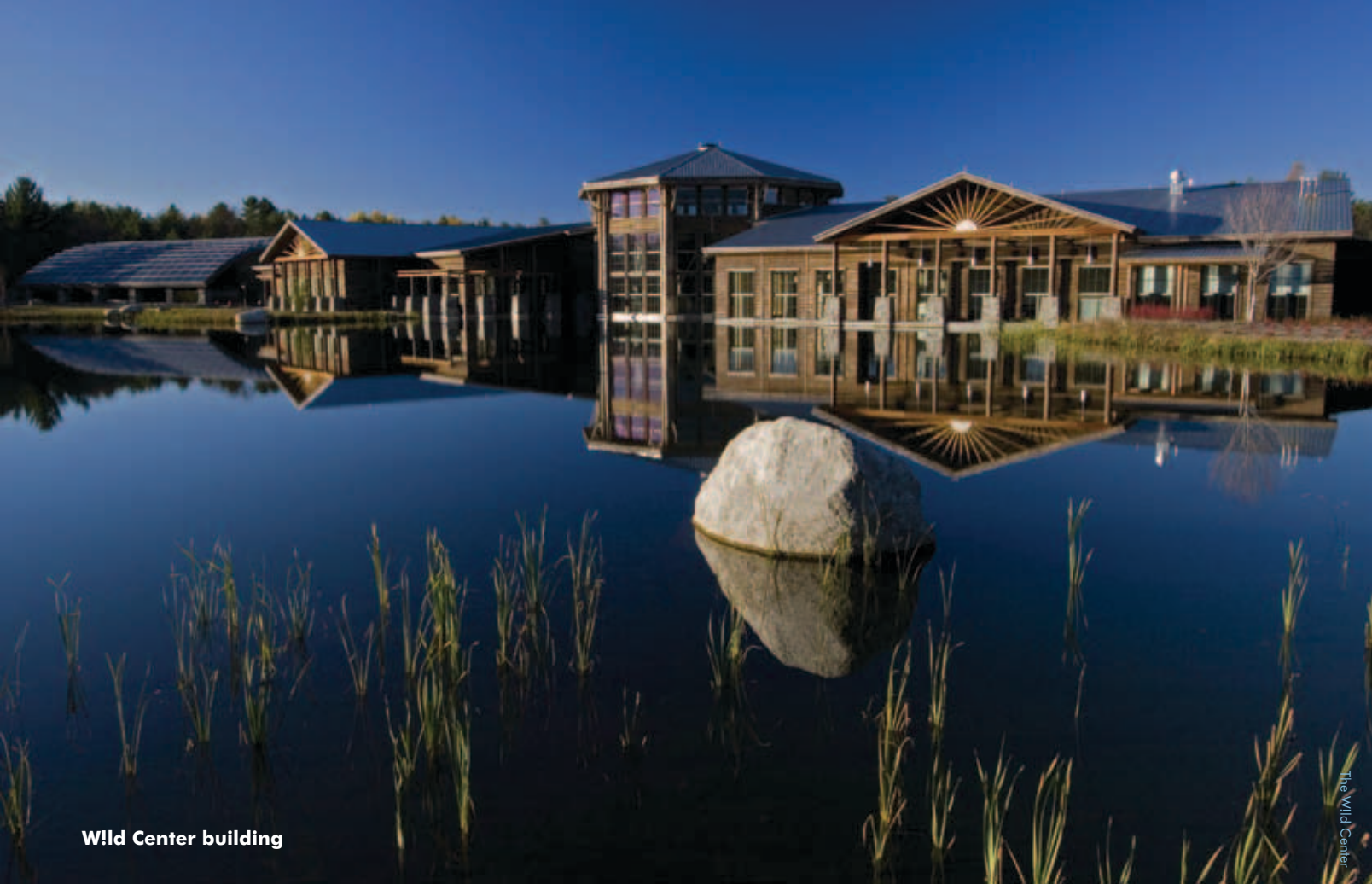
Wild Center building